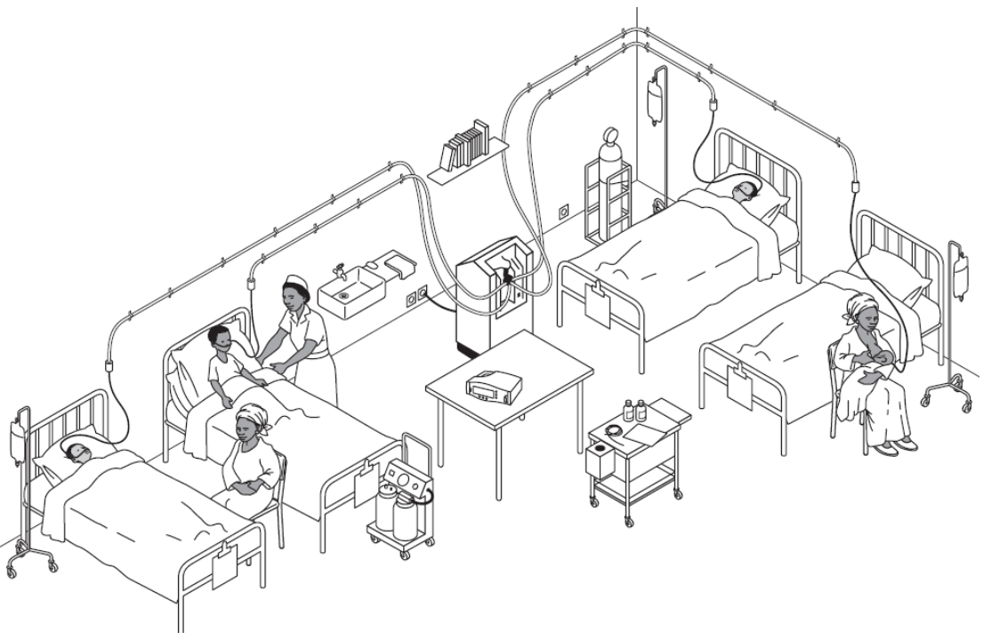
Figure 3. Schematic of the high dependency unit. Each concentrator will be fitted with a flow-splitter to distribute output flow to 4 beds. Using 2 concentrators, this allows oxygen delivery to 8 beds. Oxygen tubing will be mounted on walls, preventing difficulties with transport of heavy oxygen cylinders.