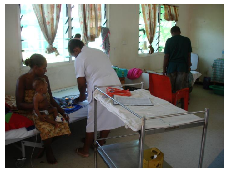
Figure 2. Monitoring of oxygen saturation of a child recovering from severe pneumonia